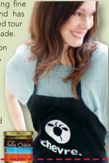
Belle Chevre Cheese Shop Elkmont, AL

Sickler Farm, a 140-acre farm in Moatsville, West Virginia, grows spring flowers, vegetable starts, mums and pumpkins. They offer you-pick vegetables in the summer, hay rides, a pumpkin patch in the fall, and welcome farm visits.