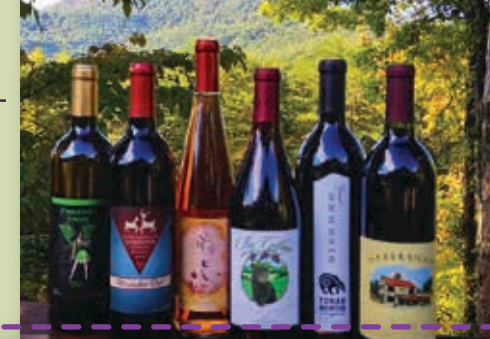
Unicoi Wine Trail Helen, GA

Wine tastings and delicious local food make the wineries and vineyards of the Appalachian Region an enticing destination for visitors!