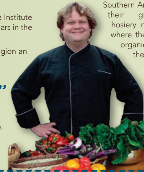
Fish Hawk Acres Rock Cave, WV