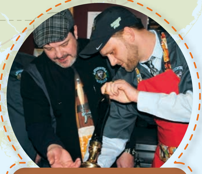
Antietam Brewery & Restaurant Hagerstown, MD