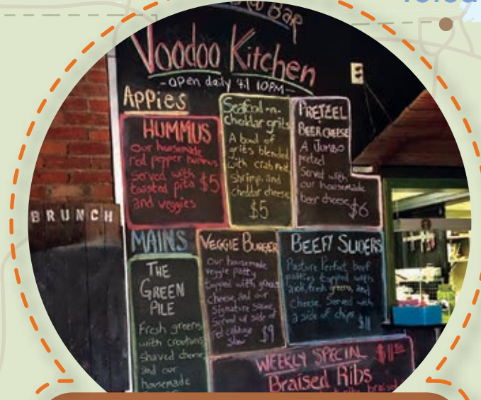
Voodoo Brewery & Brewpub Meadville, PA