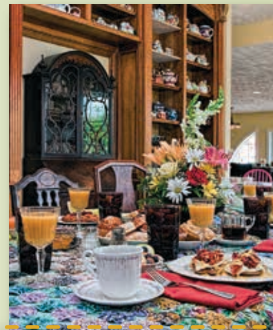
Country Girl at Heart Farm Munfordville, KY

Nestled among green rolling hills in Hart County, Kentucky, Country Girl At Heart Farm is an eco-friendly farm and bed and breakfast serving delicious seasonal meals made from local, natural, and organic ingredients. Their Full Country Breakfast changes daily and is based on the innkeeper's choice – usually beginning with fresh fruit hand-picked on the grounds. The Harvest Table Restaurant, in Meadowview, Virginia, was named the 'Greenest Restaurant in the Blue Ridge region', by Blue Ridge Outdoors magazine. Their philosophy and practice of operating as greenly as possible contributed to the designation, but the major reason is most certainly their commitment to offering diners local and sustainable meals prepared from the freshest seasonal ingredients they can find. There are a host of other farm-fresh restaurants and eateries to satisfy a visitor's palette in this heritage-rich region of the country, as well.