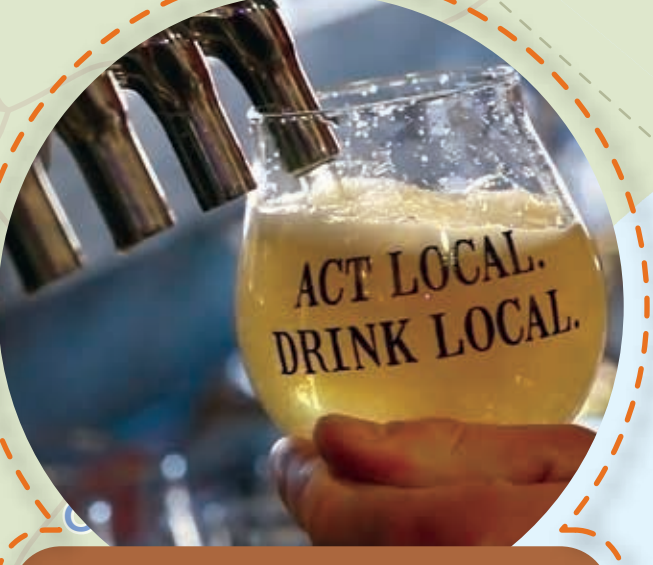
Appalachian Mountain Brewery Boone, NC