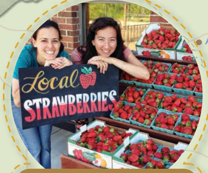
Swamp Rabbit Cafe & Grocery Greenville, SC