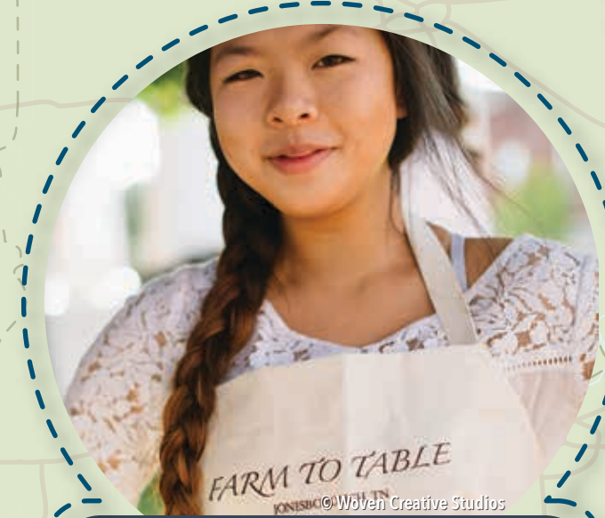
Jonesborough Farmers Market (Farm to Table Dinner) Jonesborough, TN