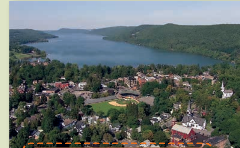
Cooperstown Beverage Trail Cooperstown, NY

Experience one of the oldest traditions of this culturally-rich region by visiting one of its unique distilleries.