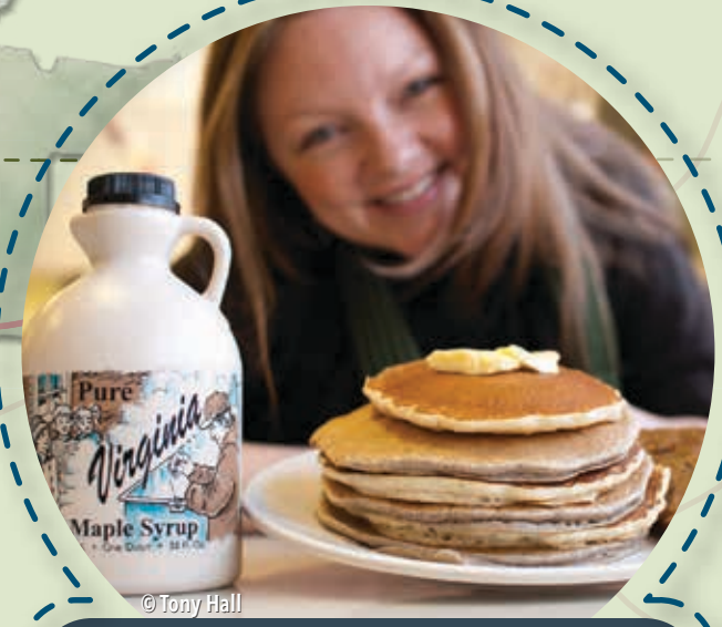
Highland Maple Festival Monterey, VA