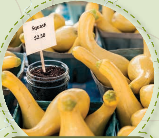
Starkville Community Market Starkville, MS